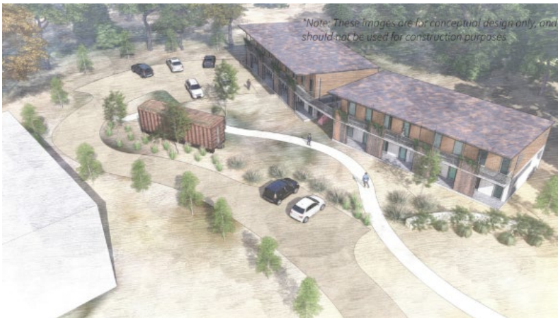
Figure 1: Conceptual plan for the Boxcar Apartment Project with 14 affordable rental units from CHFA's SHIP Predevelopment Assistance 2022.

The Town of Silverton will go under contract for the EAIF More Housing Now Grant in March 2024.