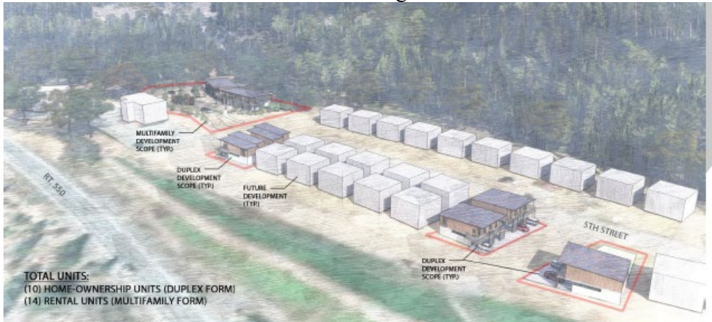
Figure 1.1 extracted from the S.H.I.P Pre-Development Assistance Report February 2022.

Staff and the Housing Authority Director spent time evaluating the original project and would like to issue another RFP for builders to facilitate the Townhome project. The setback requirements, according to the rendering below, are not in compliance with what is currently allowed at Anvil to account for snow storage, plowing and parking. The layout below compared to the lot sized might reduce the original number of townhomes, but we would like to see what builders could do in the lots identified through the RFP.